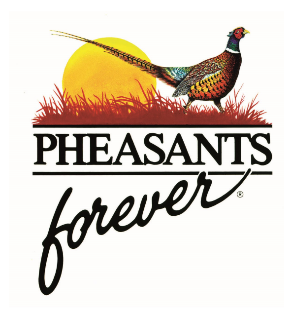
Fox River Valley Chapter Sponsor Programs